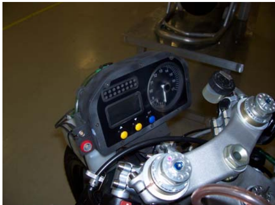
Figure 5 – The new Dashboard and Support used on the CRP Racing's 125GP Honda

The dimensions and the weight of this system are really important. Usually, the boxes are made of Aluminium or Magnesium alloy, the ECU is fundamental for the engine performance and it really has to be protected in the better way. In order to minimize its weight and therefore its influence on the bike's balance, the characteristics of the Windform® XT material were exploited to realize ECU/DASHBOARD box and its support that fixes it to the frame of the vehicle.