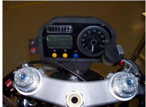
Figure 8 – CRP ECU ready to be assembled

During the 2007 Road Racing Italian Championship's race at Monza, the weather conditions were quite bad during the whole weekend. It was therefore an occasion to test the waterproof qualities of the Dashboard.