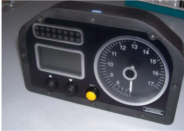
Figure 7– Particulars of the CRP ECU

Windform® XT material was chosen because better and most performing compared to the other materials previously used such as Magnesium and aluminium.