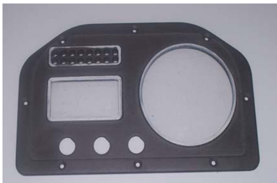
Figure 9 – ECU/Dashboard covers

Both solutions gave positive waterproof qualities results. The dimensions of the dashboard were different compared to the standard ones and this is why we had to use a special support, still made in Windform® XT and fixed to an aluminium pipe thanks to 4 screws.