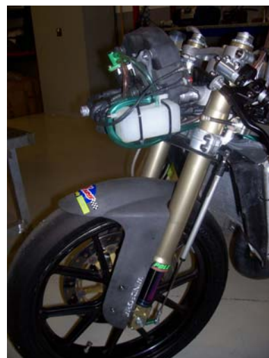
Figure 13– Dashboard and Support on the bike