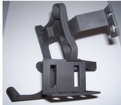
Figure 11 – Dashboard Support (side view)