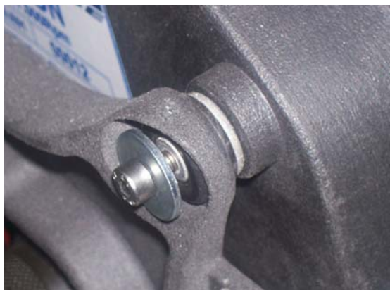
Figure 14 – Support and fixing system

As it can be seen in the pictures both the dashboard and the support are united by a mechanical fixing through screws and elicoil. This guarantees the possibility to disassemble the various components again and again.