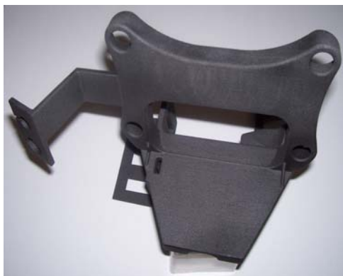
Figure 10 – Dashboard Support (front view)

Both solutions gave positive waterproof qualities results. The dimensions of the dashboard were different compared to the standard ones and this is why we had to use a special support, still made in Windform® XT and fixed to an aluminium pipe thanks to 4 screws.