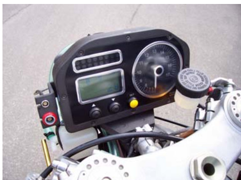
Figure 2 – The new Windform® XT Dashboard made by SLS

All these characteristics are important for the final performance: if the electronic components of the motorbike don't work neither the bike can work!