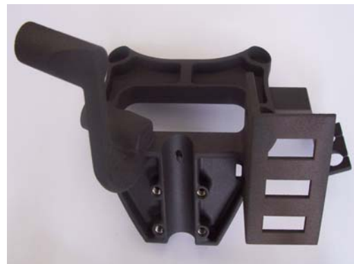
Figure 12 – Dashboard support (lower view)