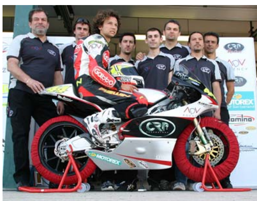
Figure 3 – CRP Racing Team

CRP Racing has been founded in December 2006, as CRP Technology's Racing Department. Its first goal is to bring its innovative way of working into a very conservative world: the Motorcycling Racing World, as already done in other top categories, from F1 to Rally Raid and from Le Mans Series to WRC. More than 30 years of experience in Motorsport at top level allows it to jump the boundaries of the motorcycles sector, where CRP Technology mainly worked with its engineering staff.