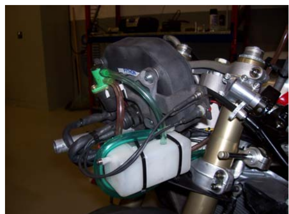
Figure 15 – Complete assembly