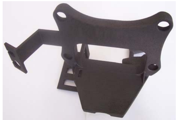
Figure 6 – The Dashboard and Support

In detail the box has been realized with a of 1,2 - 1,5 mm thickness and "wraps" electronic boards.